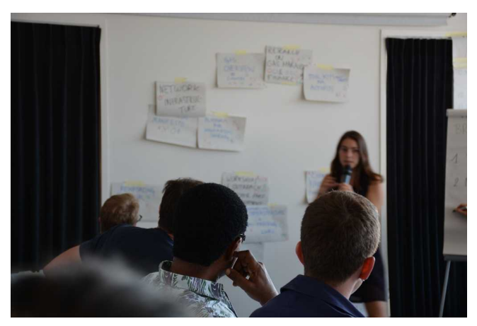
Illustration 2: Gastivists facilitating a strategy meeting

We organized a double digit number of actions, meetings and events around gas at and during COP23 in Bonn where besides reaching hundreds of delegates, we got an excellent social media response (tens of thousands of views), as well as some newspaper and TV coverage. (Democracy Now programme on fossil gas: <a href="https://www.democracynow.org/2017/11/16/activists_at_cop23_decry_companies_corporate">https://www.democracynow.org/2017/11/16/activists_at_cop23_decry_companies_corporate</a>)