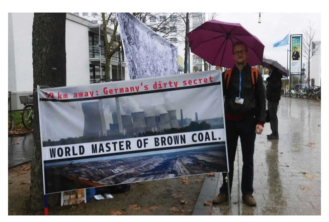
Illustration 9: The Coal vigil outside the main entrance to COP23.

Outside main COP23 entrance we manned a coal information point, drawing attention to the coal being mined just outside Bonn and the destruction of the beautiful Hambach Forest and exposing the unwillingness of the German and NRW governments to let go of coal. We coordinated a shuttle service with volunteers from the region which allowed over 100 journalists, government and non-government COP delegates to visit Hambach Forest and Hambach Mine – Europe's biggest coal mine.