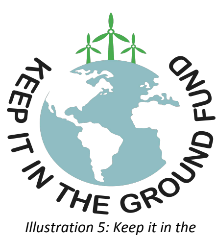
Ground Fund logo

We created a website and visual identity for the Keep it in the Ground Fund which aims to channel resources which are currently used for offsetting projects towards more effective efforts to keep millions of tons of CO2 in the ground.