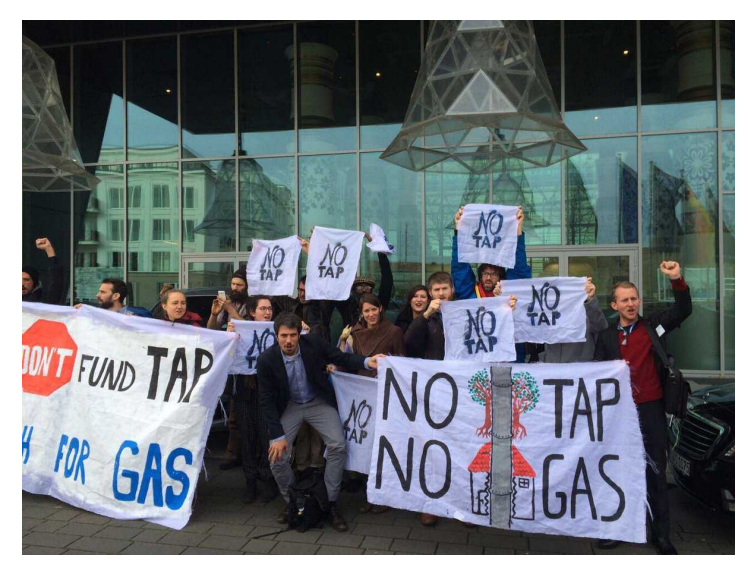
Illustration 4: NoTAP solidarity action in Bonn

We organized an international "NoTAP" Day of Action with actions in nine cities in 7 countries. TAP stands for the Trans-Adriatic Pipeline, a major fossil gas pipeline currently trying to get multibillion Euros of public support.