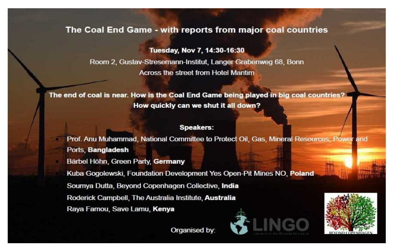
Illustration 8: Announcement of the Coal End Game workshop

We organized a workshop together with partners from India, featuring former Minister of environment of Northrhine Westphalia Bärbel Höhn and speakers from four continents.