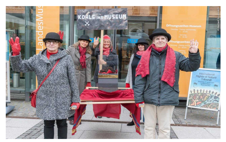
Illustration 7: Putting coal into the museum - Action framing the Lignite case at the Rights of Nature Tribunal

We helped organize the case on German lignite and held a training session on climate game changers at the International Rights of Nature Tribunal.