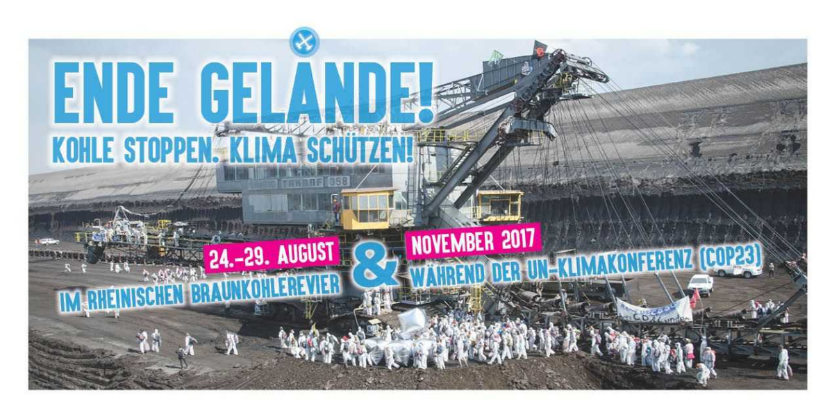
Illustration 6: Invitation for Ende Gelände 2017

LINGO is part of the Ende Gelände coalition and in 2017 we helped organize two successful actions of mass civil disobedience. We helped with translation and action logistics (August) and mobilization, speaker's programme, translation coordination (November) and some minor tasks.