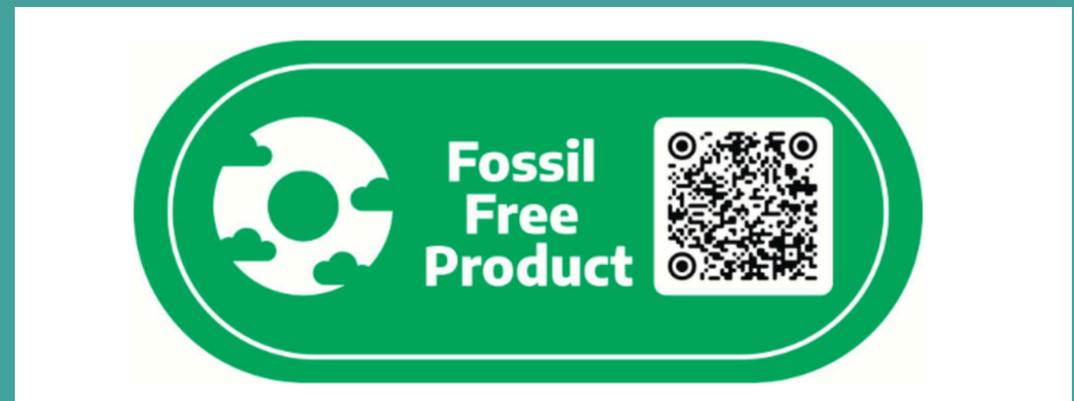
Fossil Free Product Certification