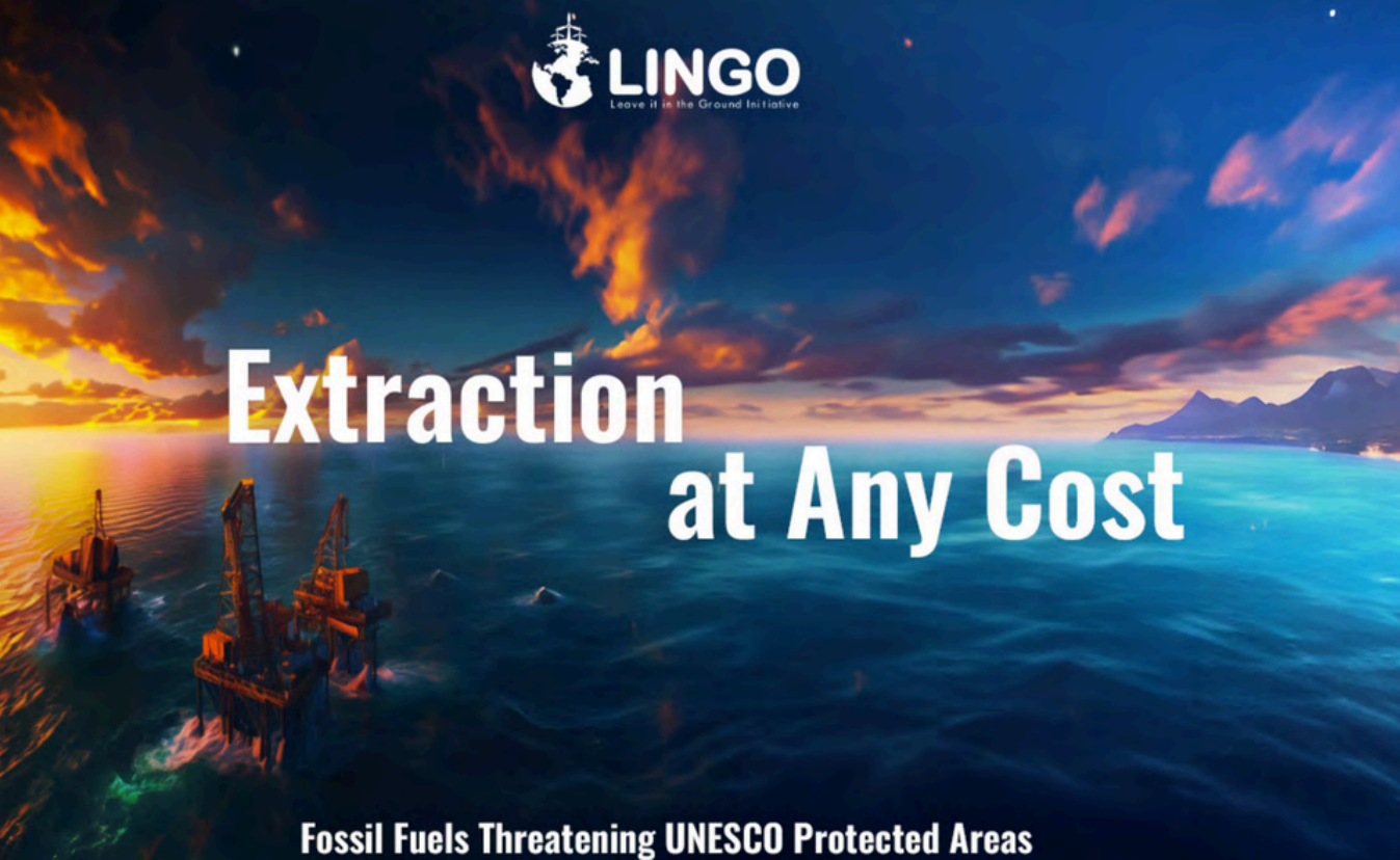
Cover of the Extraction at Any Cost report