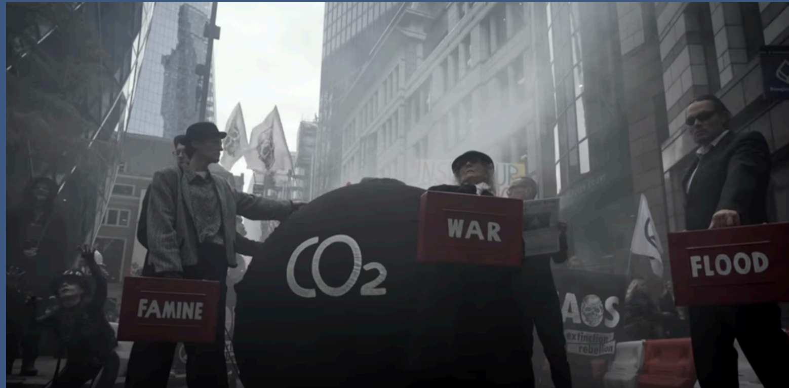
Carbon bomb imagery from the Insure Our Future action

Our team studied carbon bomb projects of the Climate COP Presidencies Troika , presenting the findings at a press conference during COP29. There, we made the case for Paris-aligned scenarios, publishing a brief on Harvest mode as an ingredient of shutting down carbon bombs.