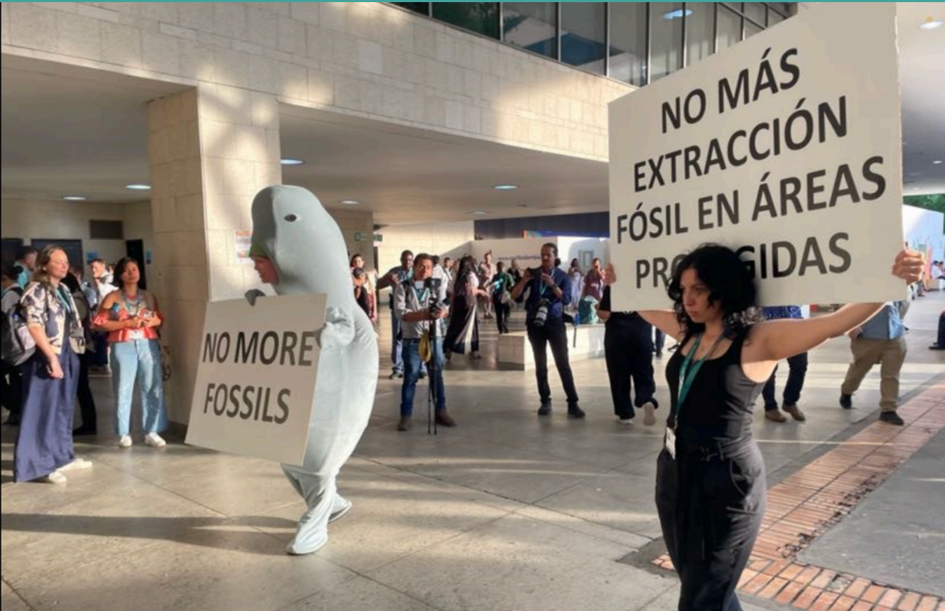
Action against fossil fuel extraction in protected areas during COP16

As part of this initiative, a toolkit on Leave it in the Ground Incentive Deals (LIDs) was published, detailing financial mechanisms for countries to fossil fuels in the ground in exchange for renewables development. Government officials from 7 countries joined us in a panel at the Francophone Pavilion at COP29, announcing openness for such initiatives and prompting us to continue working towards LIDs in the new year.